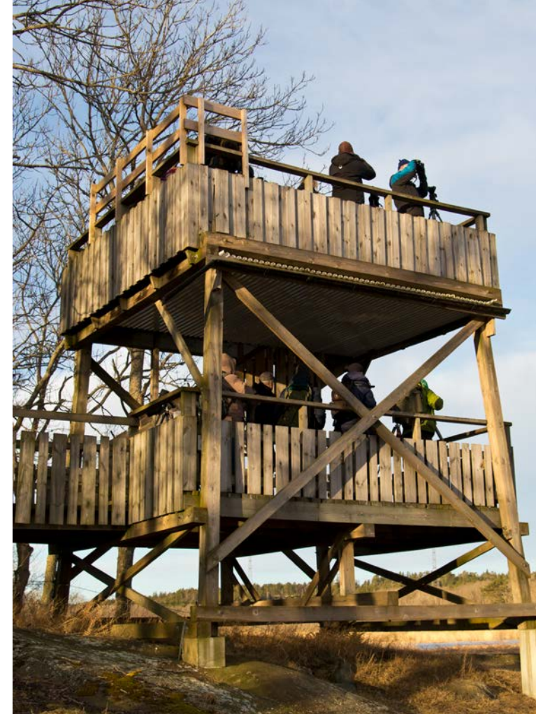
COMMON CRANE