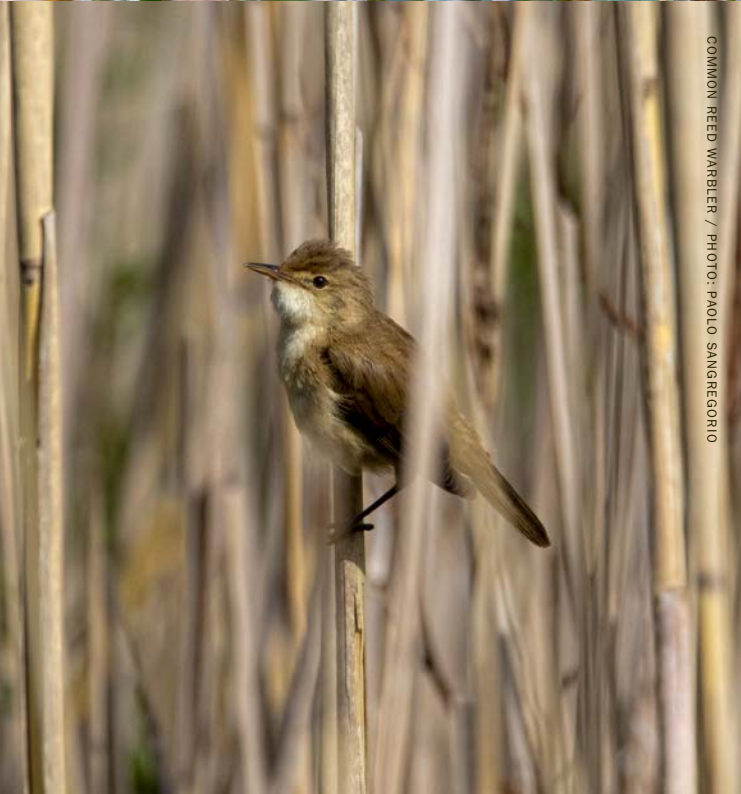
COMMON REED WARBLER

In Stockholm County there are 28 different towers to visit for bird watching. They are located adjacent to wetlands/bird lakes and have all unique structures, often made of solid wood. The towers often rise well above the ground and provide a good overview and opportunities to also study birds that migrate past the area during spring and autumn. The birds that have the lake/wetland as their home area are active at different times of the day. Several wetland birds such as bittern, corncrake, water rail, reed and sedge warblers are nocturnal and are heard at night. During the day, Slavonian grebe, various ducks, brown headed gulls and common terns can be seen foraging. The biotope is often rich with insects hatched from the water, which attracts species such as barn swallow, white-tailed pipit, meadow pipit, nightingale and woodchat. Marsh harrier, hobby and osprey often looks for food around lakes and wetlands.