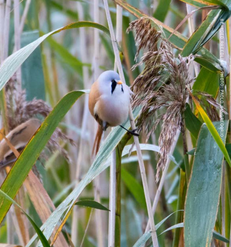
BEARDED REEDLING